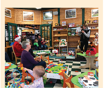
Oceana County, Literacy Celebration at Country Dairy