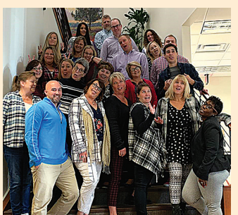
Fun With Campaigns!