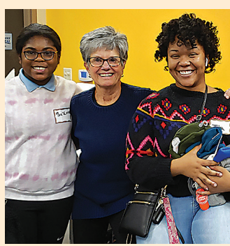
Fill The Truck Sort -A-Thon

Go to unitedwaylakeshore.org to find out more!