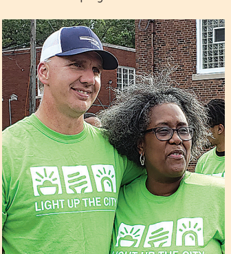
Consumers Energy Light Up The City